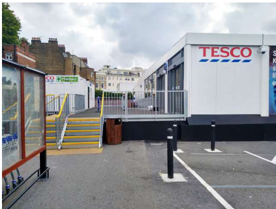
02. view of entrance stair at Kennington

The existing temporary store shown on this page, is currently being used by Tesco at Kennington (18/02598/FUL). This building is to be relocated to the Barking Tesco site, to allow continual operation of Tesco whilst the rest of the site is being developed.