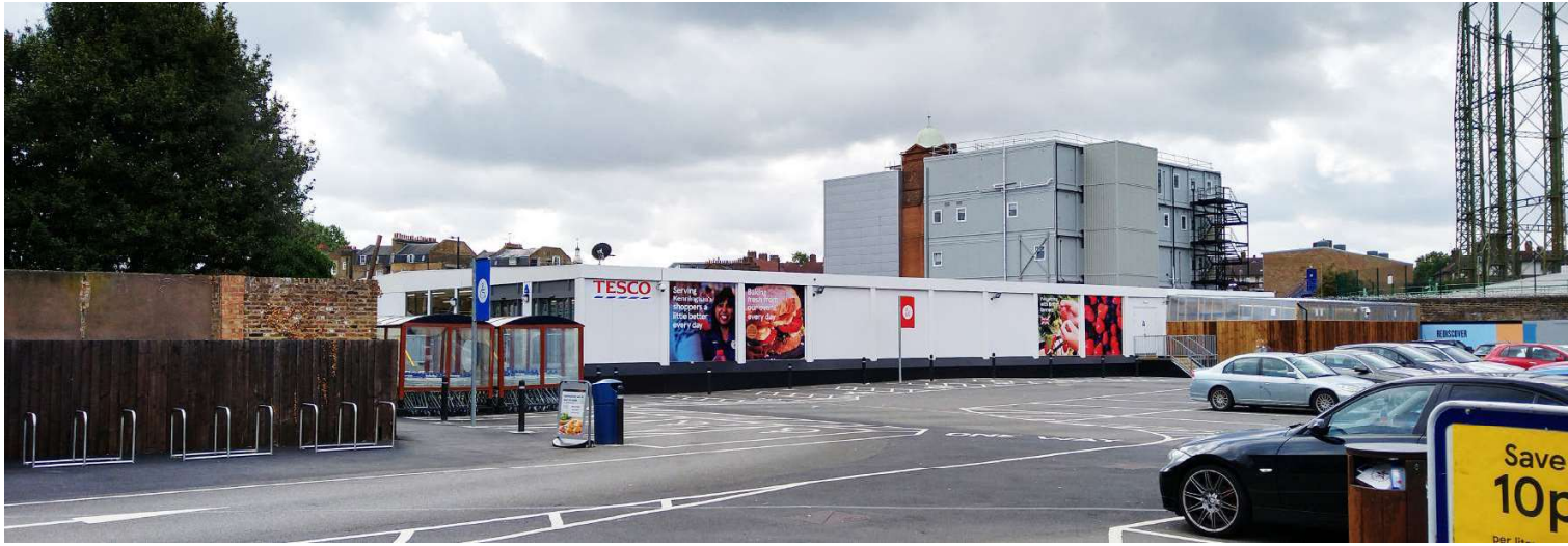
01. external view of temp store at Kennington